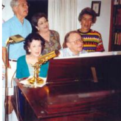
SING-ALONG AT THE CUMMING'S