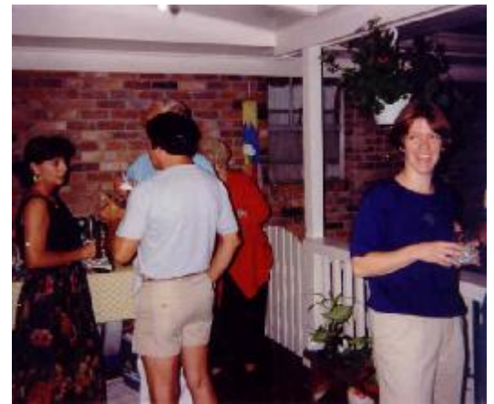
PARTY AT THE COE'S