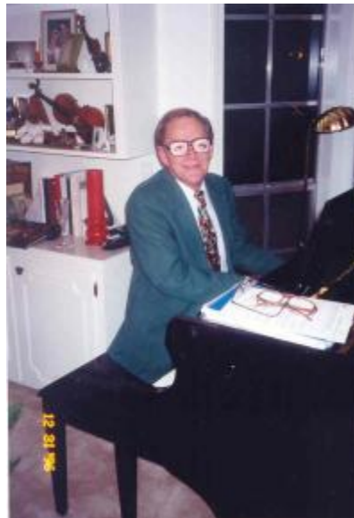
ADULT CHOIR HAS MANY FUN TIMES