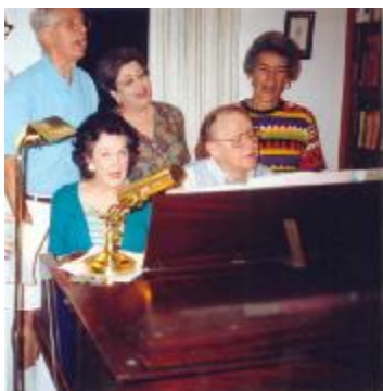
SING-ALONG AT THE CUMMING'S