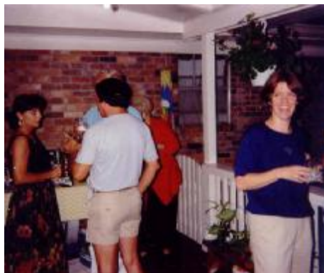
PARTY AT THE COE'S