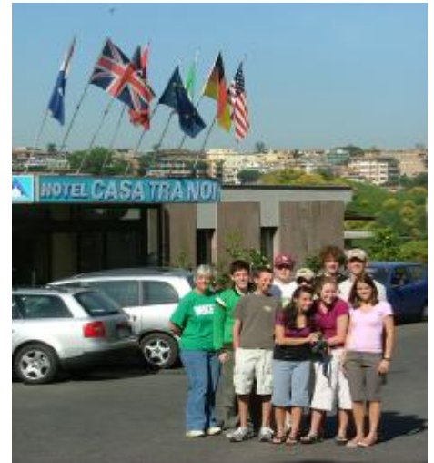
The group in front of "Casa Tra Noi" - our lodging while in Rome.

PILGRIMAGE RECAP: A sincere thank you to all whose prayer, support and contributions made the 2006 J2A Pilgrimage "In the footsteps of St. Francis" a reality. Our travel was sacred, eye-opening, exhausting and energizing all at the same time. Please watch the bulletin over the coming weeks for photo essays and reflections from our Pilgrims as they process this life-changing journey.