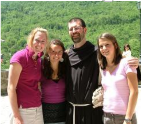
The girls and "their" monk at the Greccio monastery - they saw him again the next day at La Verna.