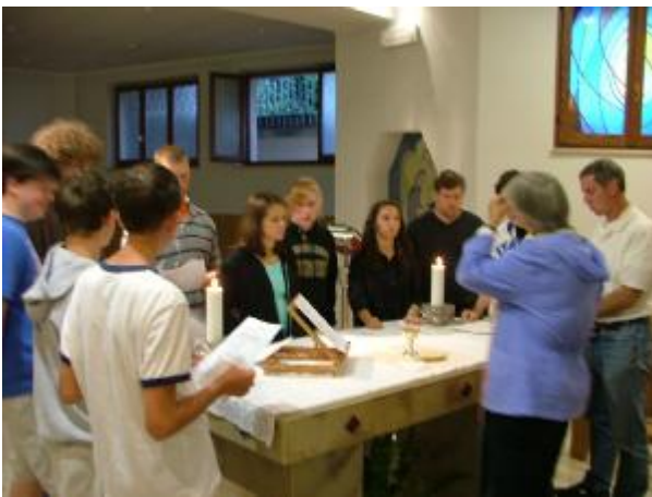
Our closing Eucharist in the chapel of the Soure di Santa Brigida di Svezia the convent